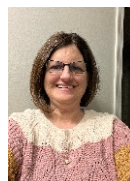
Patty Kramer Kramer's Auto Parts Grand Island, NE